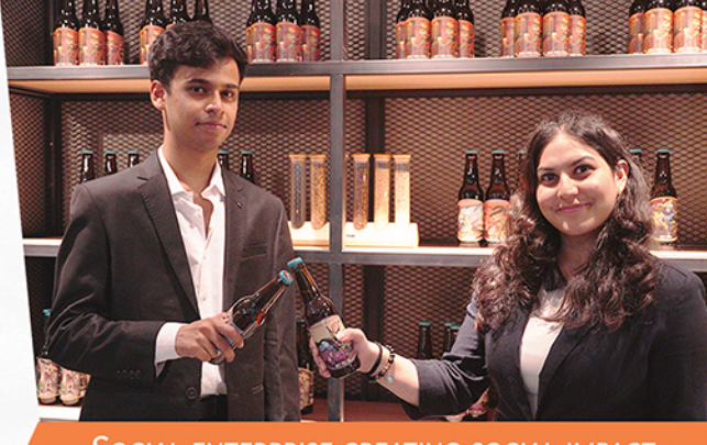
SOCIAL ENTERPRISE CREATING SOCIAL IMPACT

A student start-up team that up-cycles wasted bread into premium quality craft beer