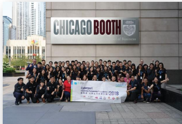
CUPP 2018-2019 Chicago Booth