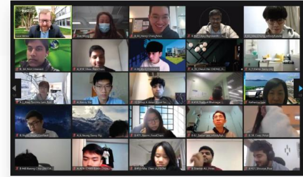
CUPP 2020-2021 IESE Business School, University of Navarra