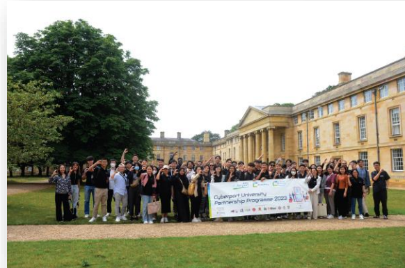
CUPP 2022-2023 University of Cambridge