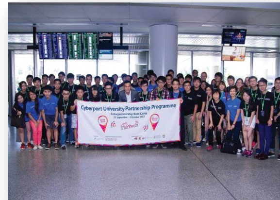
CUPP 2015-2017 Stanford Graduate School of Business