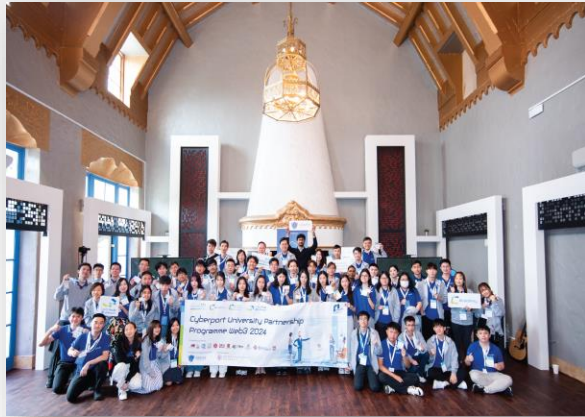
CUPP 2024-2025 Draper University Video Link